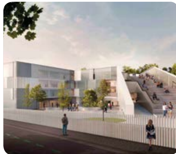
*The new School of Humanities and Communication Sciences is currently under construction.